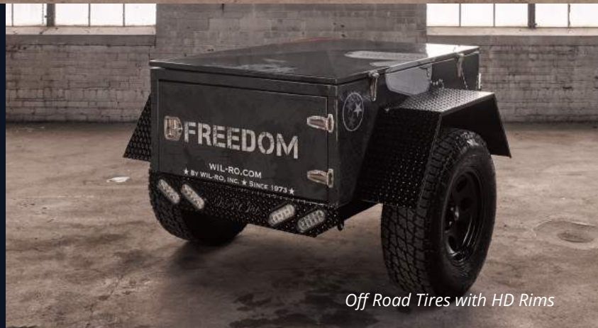
Off Road Tires with HD Rims