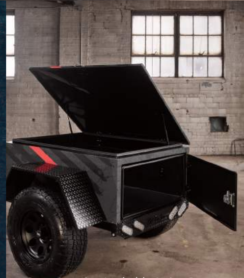
Rear Opening Lockable Swing Door